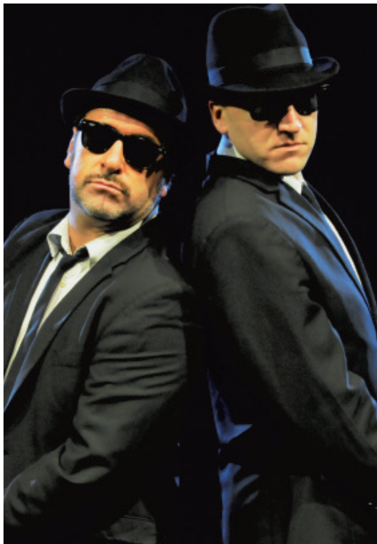
SINGING THE BLUES: The Original Tribute To The Blues Brothers is back at Milton Keynes Theatre next week