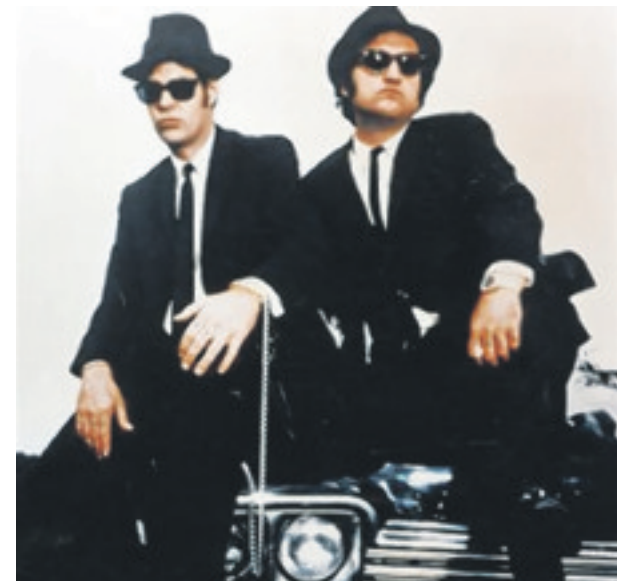
DYNAMIC DUO: Introduce a new set and moves to a classic show

The show has toured all over the world, including Australia, Japan