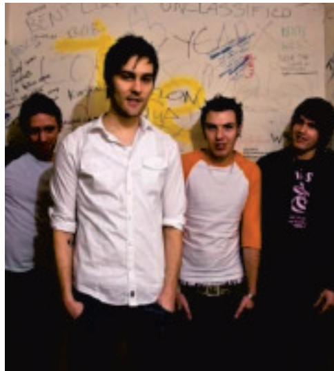
FUNDRAISING FOR ASHLEY: Local pop rock group Last Of Our Heroes will perform at the charity gig