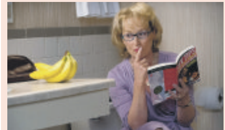
Feeling fruity: Meryl Streep is trying to get her marriage back on track in Hope Springs

Not laugh out loud funny, but there are some flashes of class.