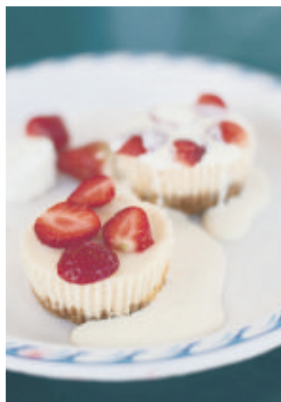
Tasty treats in store at Olney

For more about the festival, visit www.olneychamberoftrade.co.uk .