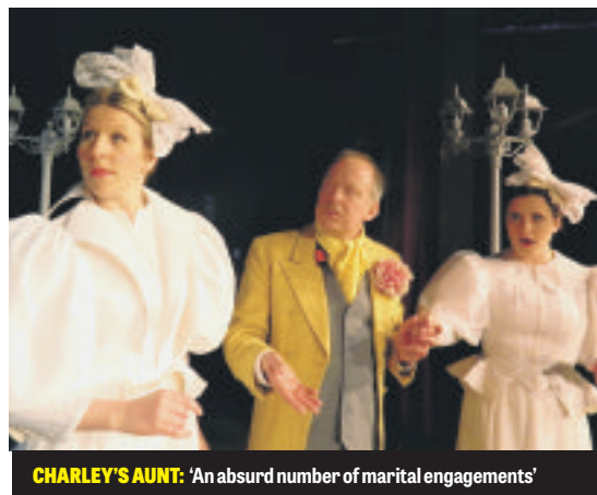
CHARLEY'S AUNT: 'An absurd number of marital engagements'

As luck would have it, Charley's Aunt is arriving from Brazil and will happily step in. However, when a telegram declares her trip is delayed the plan changes... and their good friend Lord Fancourt Babberley finds himself putting on a frock to assume her identity. With a breathtaking chase, musical interlude and an absurd number of marital engagements, prepare for hilarious madness.