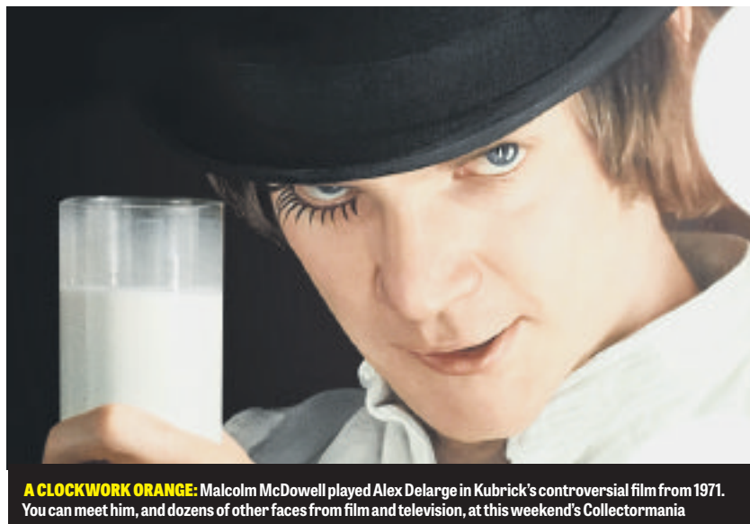
A CLOCKWORK ORANGE: Malcolm McDowell played Alex DeLarge in Kubrick's controversial film from 1971. You can meet him, and dozens of other faces from film and television, at this weekend's Collectormania