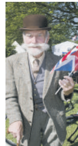
FLYING THE FLAG: Bletchley Park steps back in time this weekend.

Visit www.bletchleypark.org.uk for more information.