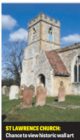
ST LAWRENCE CHURCH: Chance to view historic wall art

Friends of St Lawrence Church are opening the doors of the ancient holy house on Saturday to celebrate the Feast Day of St Lawrence the Martyr, and you are invited. The Broughton-based church – which raised a £1,000 at a similar event recently – will be displaying its famous wall paintings for all to see, and tours will be given. Refreshments will also be available, or you could opt into the village picnic, by contributing to the 'bring and share lunch'. Everyone will be made welcome between 10am and 4pm and admission is free.