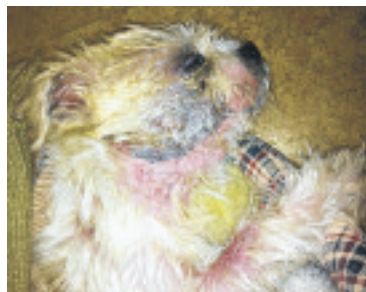
TRAGIC: Benjamin Button when he was brought in, left, and in his new home, right, before he sadly died

With the skin condition affecting his immune system