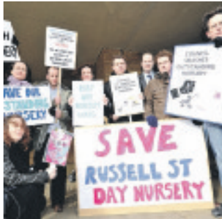
PROTEST: Parents campaigning outside the council offices

Conservative Councillor for Stony Stratford, attended Russell Street as a child and supports the parents' cause.