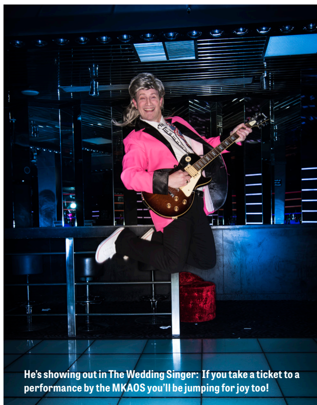
He's showing out in The Wedding Singer : If you take a ticket to a performance by the MKAOS you'll be jumping for joy too!

With a score that pays loving homage to the pop songs of the 80's, The Wedding Singer promises lots of laughs, top