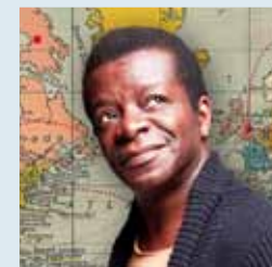
Stephen K Amos Northampton Royal November 18