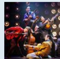
Million Dollar Quartet Northampton Derngate April 18 to 22