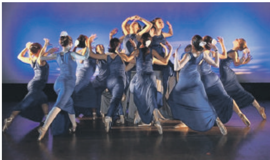
Gangster's story: the Attitude School of Dance.

With musical influences from the 1920s and 1930s, the story of The Resistible Rise of Arturo Ui will be recreated through a mixture of Russian Ballet, Jazz, Tap, Street, Contemporary and Character