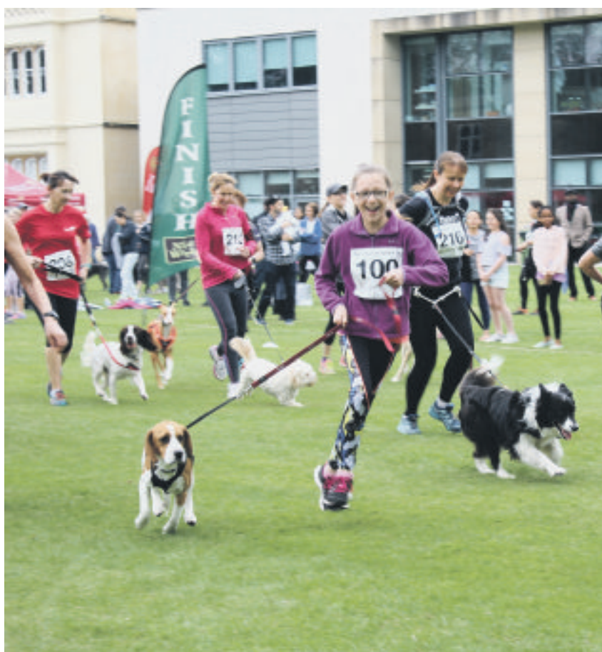
Day for dogs: the fun event at Thornton College for Medical Detection Dogs.

The students were thrilled to not only meet their target but exceed it, raising a total of £3,600.