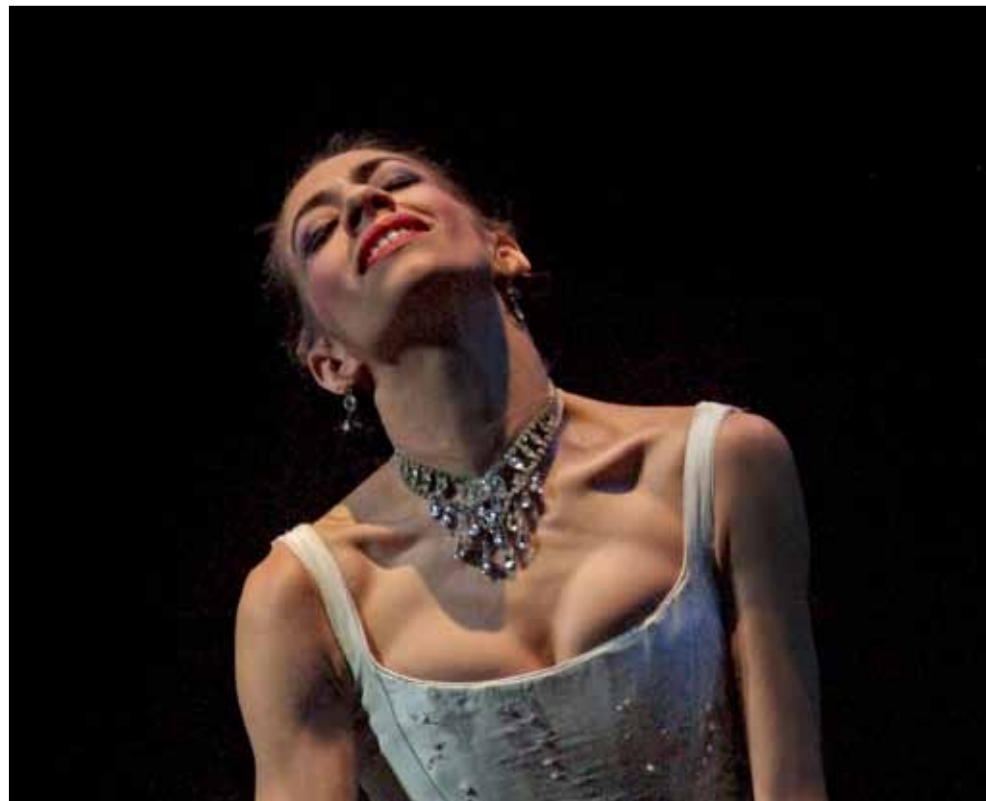
Manon: Became the paragon of adult, dramatic dance

Her brother, Lescaut, is soon approached by an old gentleman who begins bargaining for her.